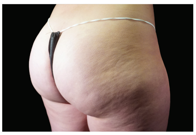
AFTER EMSCULPT: & EMTONE